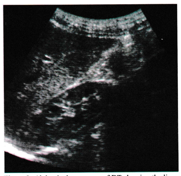
Figure 3: Abdominal sonogram of DT showing the liver in the left hypochondrium and the left kidney. Both organs demonstrate normal anatomy and echopattern.

Cardiac ultrasound scan using 8.0MHz linear probe, demonstrated normal left atrium and left ventricle and normal right atrium and right ventricle.