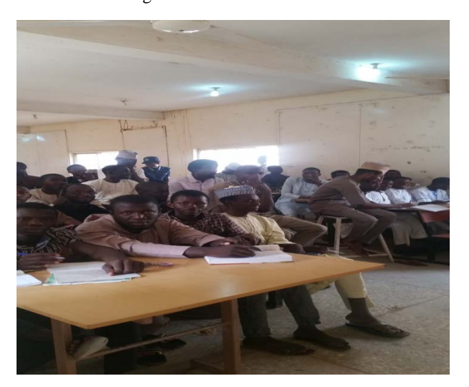
Plate I. Congested Nature of 100 Level Studio during the Lecture Time

The research findings show that: "inadequate facilities in the studios such as the drawing boards have led to the impossibility of all the students working in the studios at the same time when there are no lectures, and these have negatively affected the avenue for the students to learn from each other in the studios; inadequate drawing boards in the studios have also led to the congestion in the studios as more than one students are attached to a drawing board during lectures. These are in line with the result of the study made by [19] that showed that many schools find their classroom environments inadequate to address certain teaching and learning conditions due to space limitation, storage issues or the classroom lacking specificity to programme. The findings further showed that the number of the students that are not satisfied with the spaces in studios in relations to their population are significantly rated high due to congestions". The research conducted by [14] on the determination of the state of architecture studios in the university in Nigeria further revealed that: "Plate I shows the congested nature of 100 level studio during the lecture time.