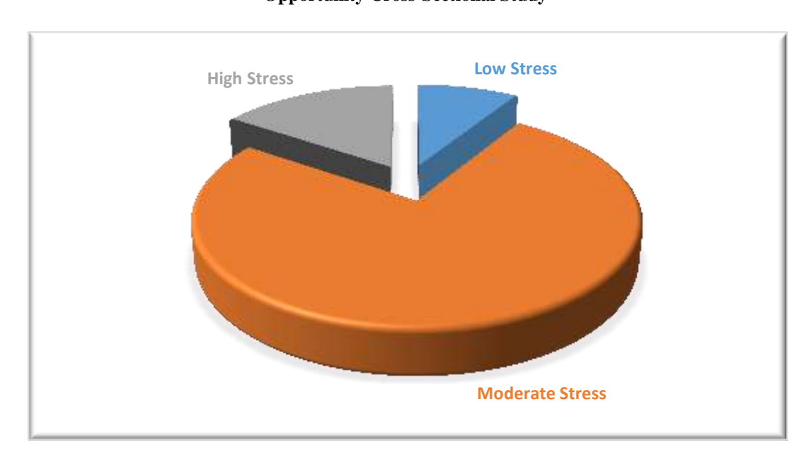
Eseigbe P et.al / Perceived Stress and Correlates among Women in an Urban Northwestern Region of Nigeria: An Opportunity Cross-Sectional Study

No/low level = 31 (9.0%), Moderate level = 261 (75.4%), High level = 54 (15.6%).