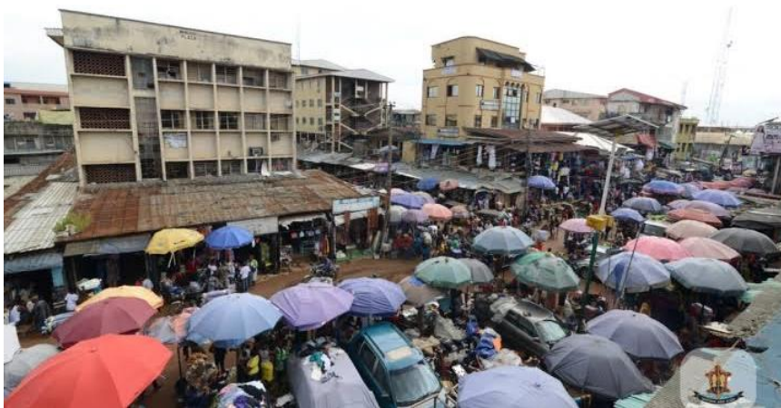
Figure 3. Onitsha Main Market showing Sandcrete Block Walls that are Plastered with Mortar and without Fire Resistant Paint.