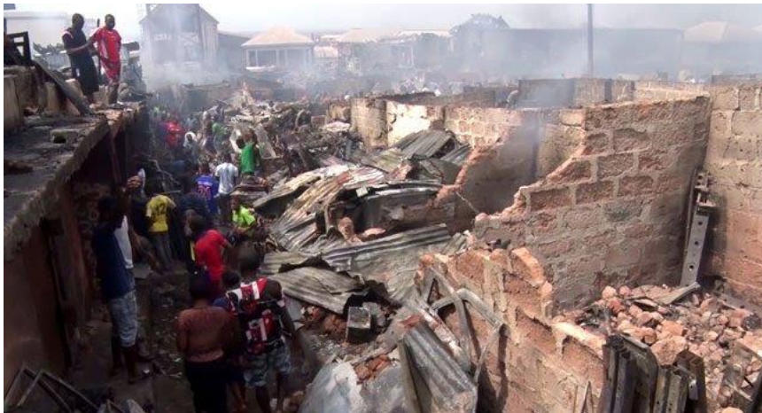
Figure 2. Old Motor Parts (Mgbuka) Market showing Burnt and Collapsed Sandcrete Block Walls.