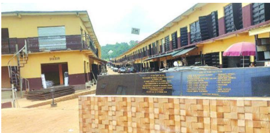
Figure 4. Building Material International Market showing Sandcrete Block Walls that are Plastered with Mortar, and without Fire Resistant Paint.