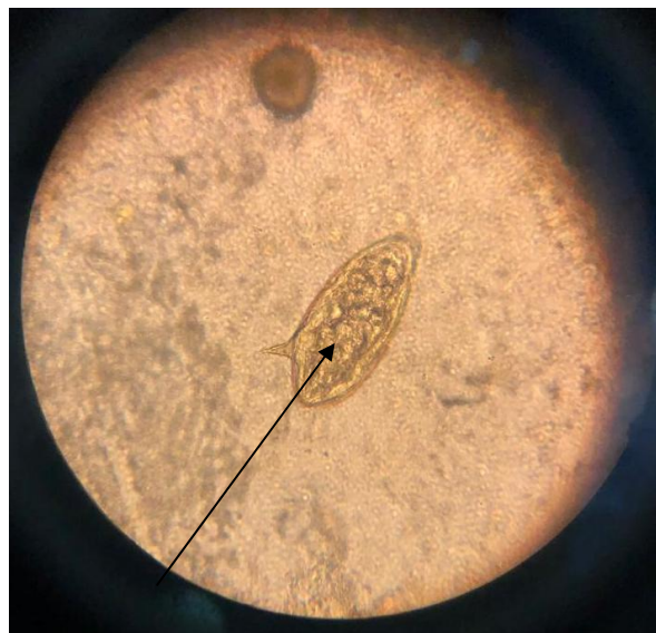
Plate 1. Egg form of Schistosoma mansoni

Infection rate of gastrointestinal helminths infection varied between sexes with males recording a higher prevalence of infection (51.0%) than females (39.3%). Statistical analysis also showed that there was a significant difference between infection according to the sex ( p=0.04 ). Highest prevalence of infection recorded among males may be attributed in part to the super active nature of males who mostly engage themselves in activities such as playing in the soil that exposes them to ova of helminthes such as hookworm which was most abundant in this study. Females on the other hand are quite reserved and as such recorded lower prevalence when compared to males.