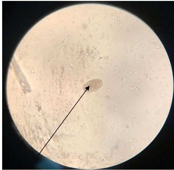
Plate 2. Ova of hookworm