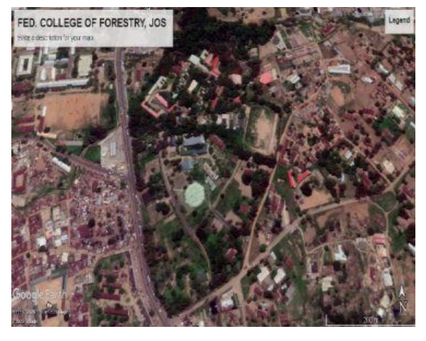
Figure 2: Google earth satellite imagery of Federal College of Forestry, Jos and Environs