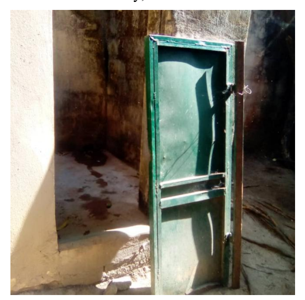
Plate 1: A door hanging on its hinges