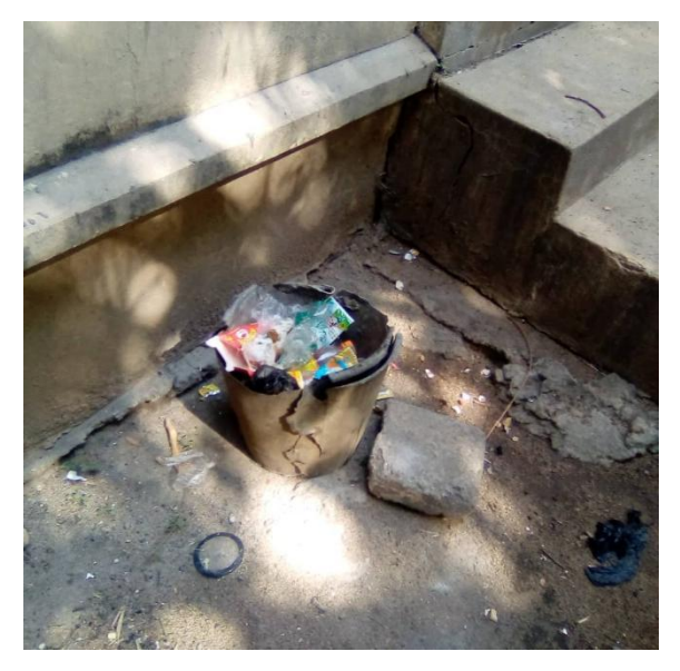
Plate 2: Disposal of wastes in open spaces