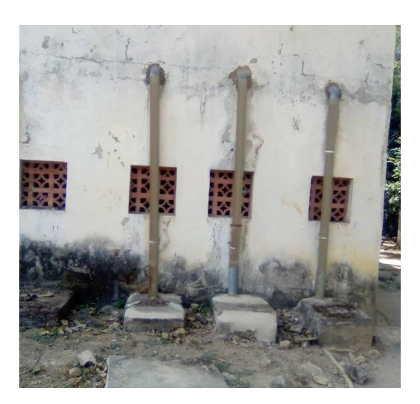
Plate 4: Exposed pipes to inspection chamber

Students' perception of electricity, firefighting equipment, and laundry services were ranked high while toilet facilities, security and water supply were ranked least available. The facilities ranked least available are inadequate in number for use and positioned far from hostels. The findings are in line with the studies of (Ajayi, et al., 2015; Rotowa, et al., 2016) of Nigeria which reveals that students are dissatisfied with hostels' location of bathrooms as well as cleanliness and an inadequate number of kitchenette facilities of Federal University of Technology, Akure, Nigeria.