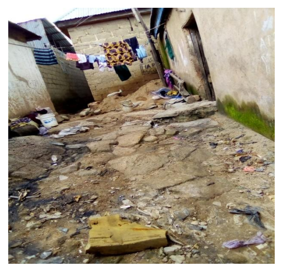
Plate 3: Condition of physical environment

Plate 1 reveals one of the toilet doors hanging on it hinges. As shown in Plate 2 wastes are disposed in open spaces within the hostels which makes it an eyesore and can propagate easy outbreak of diseases like cholera. Plate 3 is the condition of physical environment, while Plate 4 reveals exposed toilet pipes connected to the inspection chamber of the soak away pit of Old Obeche (Boys Hostel).