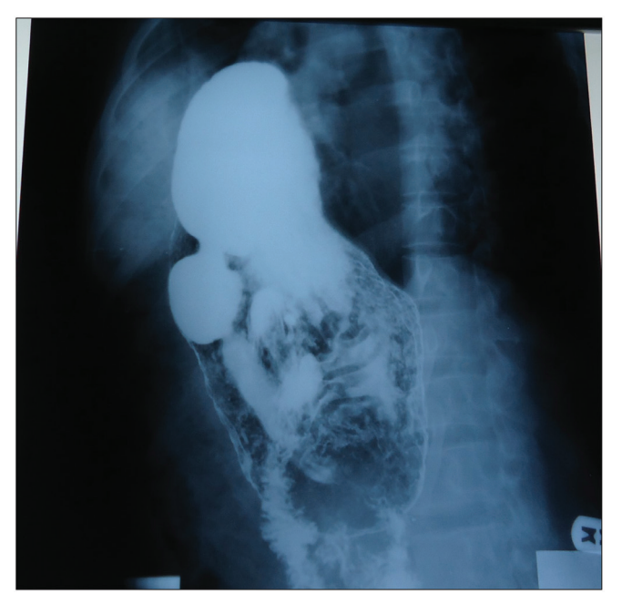
Figure 1: A contrast study showing the outline of the stomach in the chest

This is a retrospective case series of TDI in two tertiary institutions in the country. TDI is a relatively rare condition, and there is a high tendency for it to be missed if thorough clinical assessment and imaging review are not carried out, and the absolute number of TDI is dependent on the overall number of chest trauma; the number of cases of TDI (is directly proportional to the incidence of chest trauma) tends to increase as the number of chest trauma increases.<sup>[14]</sup> The incidence of TDI in patients with chest trauma ranges between 1.3% and 6.5\%^{[14,15]} and about 54.2%of those had thoracotomy following chest trauma from our recent review.<sup>[16]</sup> The incidence of 4.3% from this series is similar to the 6.5% reported by Adegboye et al. about two decades ago.<sup>[15]</sup> The implication is that TDI following truncal injuries is quite uncommon, and thus attending emergency physicians should be alert to identify any of