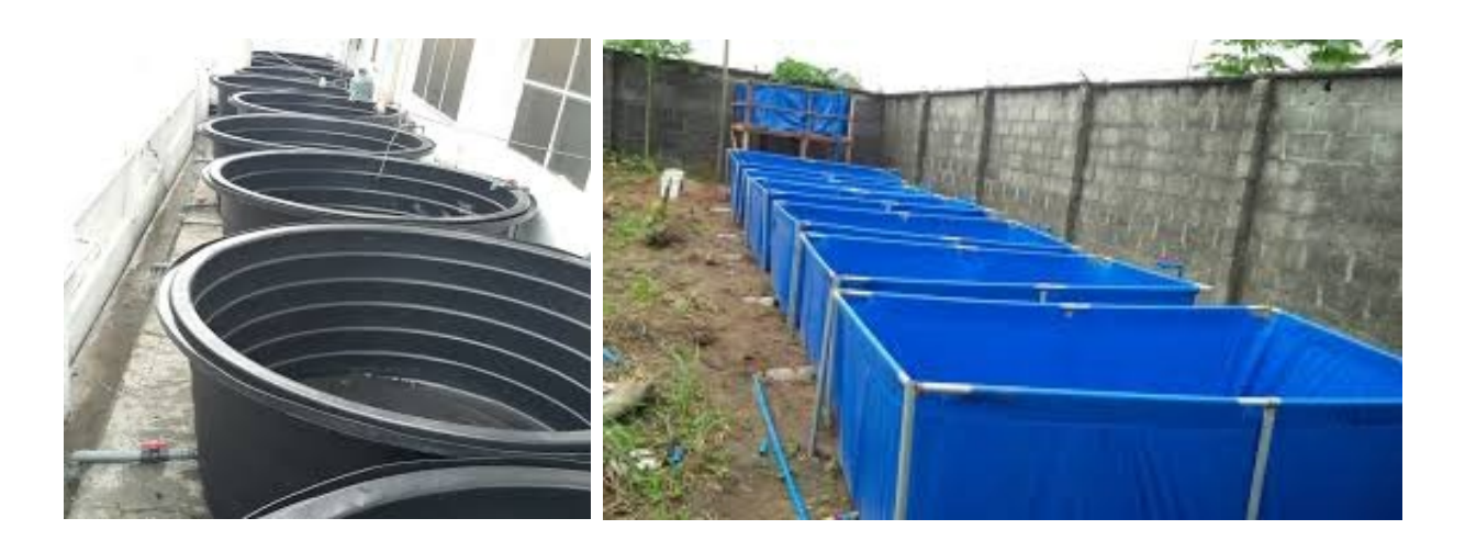
Circular Plastic (PVC) Tanks