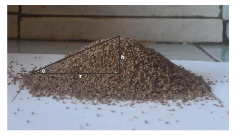
Figure 2: Acha Heap used to Determine Angle of Repose

The Fixed Funnel and the Tilting Box methods, both described by Teferra (2019), were used to determine the angle of repose of acha grains. In the fixed funnel method, the material was continuously poured through a funnel to form a cone as shown in Figure 2.