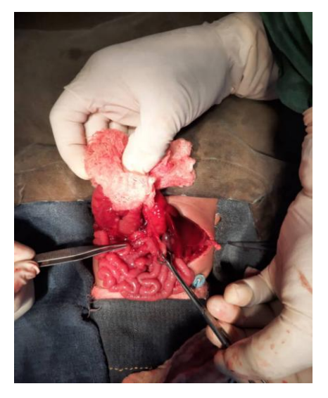
Fig. 2. Type 3 Duodenal atresia

after surgery. He tolerated food and made a full recovery. He was discharged to go home and seen for follow up to assess his wound healing and adequacy of nutrition two weeks after discharge. He was then subsequently referred to a paediatric cardiologist for follow up.