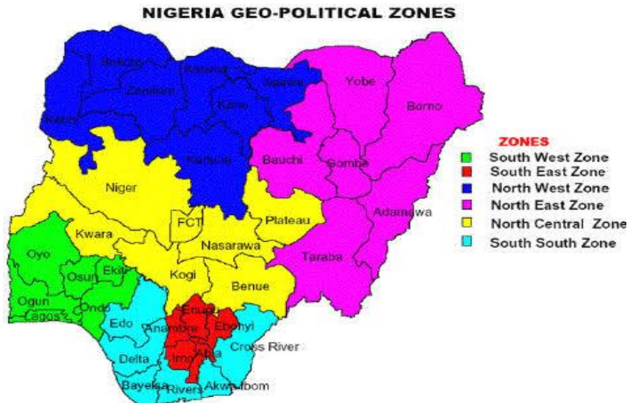
Fig. 3: Map of Nigeria Showing the six geo-political regions

The study area for this research is Nigeria, South-West of Africa.