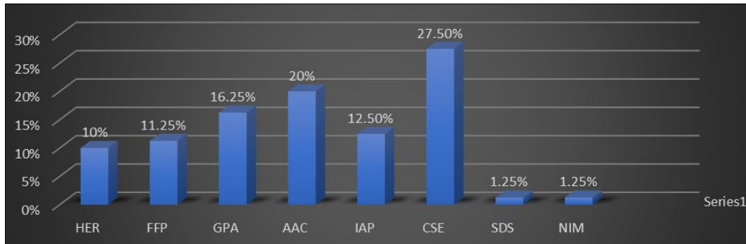
Fig 3: A chart representation of topics responders most highlighted. It shows implementation of policies to scale up Comprehensive Sexual Education as the highest point and policies to bring an end to SRHR as the lowest point made.