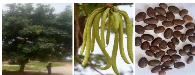
Figure 1: Photographs of the whole plant, pod, and seeds of P. biglobosa