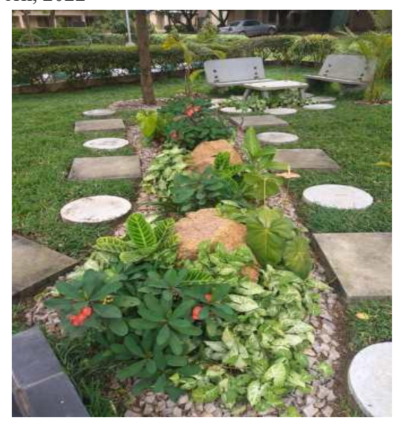
Plate III: Girls hostel court (Buffalo, Ebony I & II) Plate IV: HLT department micro-open space Landscaped walkway