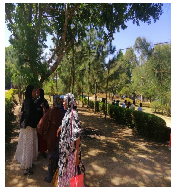
Plate II: Badejo Hall micro-open space