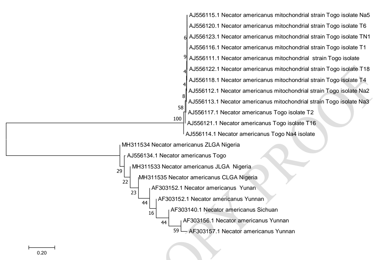
Fig. 2: Phylogenetic Tree of the Hookworm Isolates Obtained From Peasant Farmers.

Chikun LGA tends to be more closely related than that of Zaria LGA. There is also a close genetic relationship between the isolates ( N. americanus ) from this study area (Kaduna, Nigeria) and those of Togo and China.