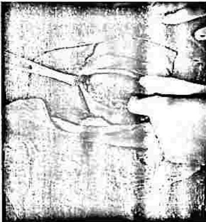
Fig. 3. Polysplenia in the right hypochondria