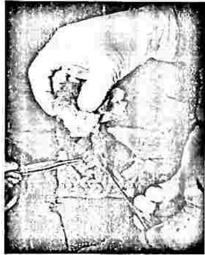
Fig. 2. Type 3 Duodenal atresia