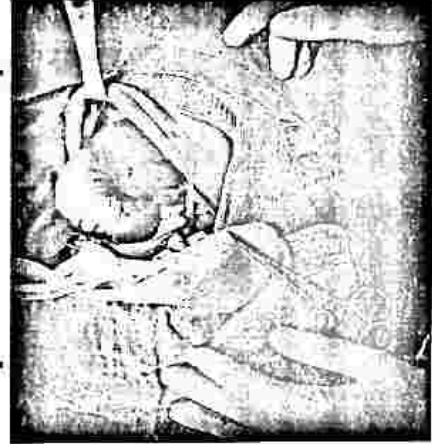
Fig. 4. Liver in the left hypochondria