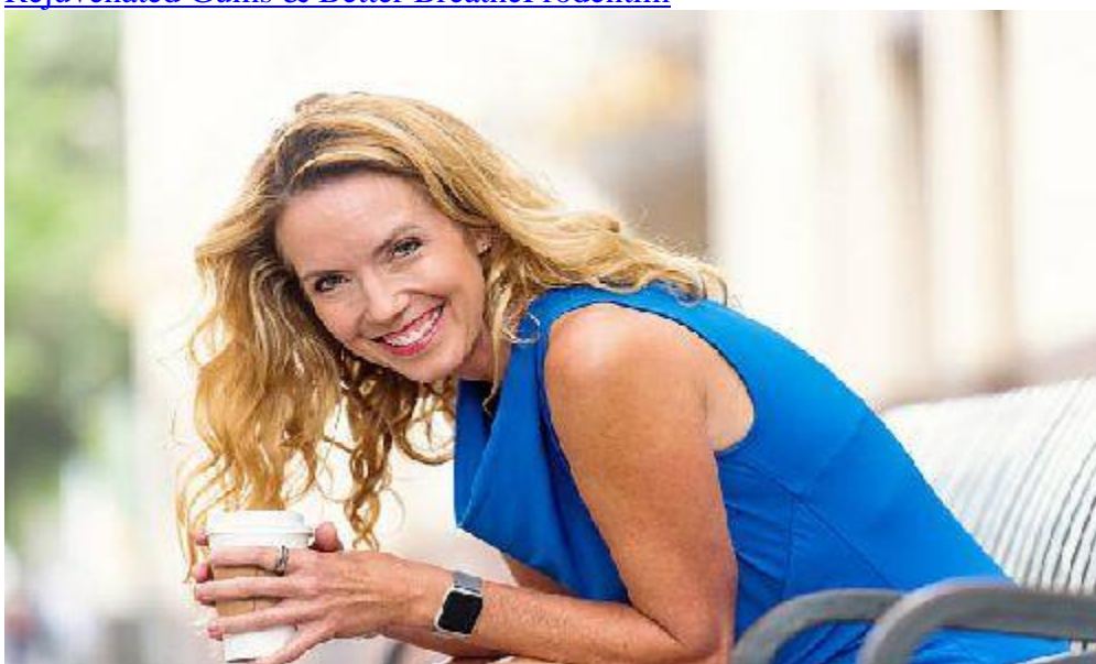
Rejuvenated Gums & Better BreatheProdentim