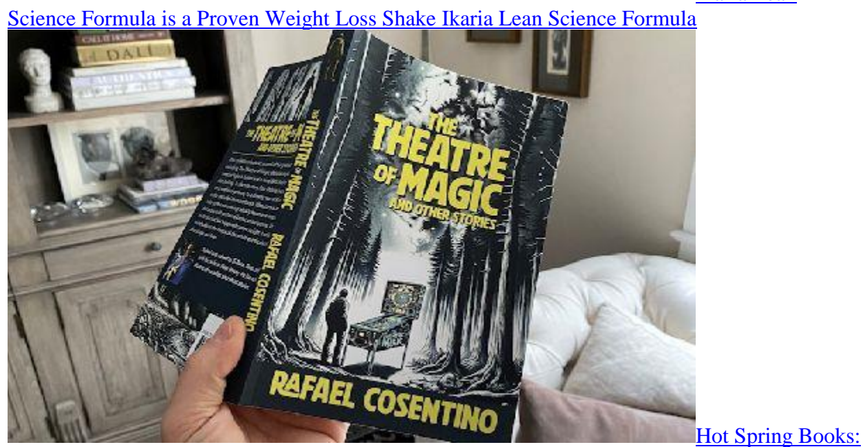
The Theatre Of Magic (Now a Best Seller)Amazon Books